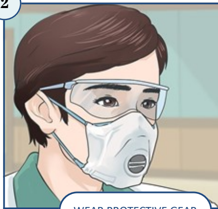
WEAR PROTECTIVE GEAR

Wearing gloves while cleaning lead dust is recommended. It is also recommended to wear a facemask that covers the nose and mouth and goggles to protect the eyes.