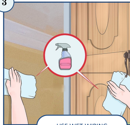
USE WET WIPING

Use damp cloths or disposable wipes. Be sure to dust the doors, walls, and windows of your home. Pay extra attention to corners, crevices, trim, and molding.