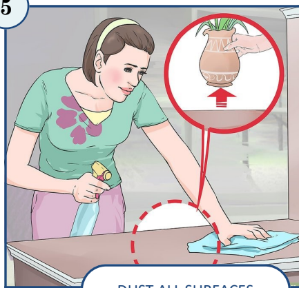
DUST ALL SURFACES

Remove any decorative items from surfaces. Again, be sure to use a damp cloth or disposable wipes.