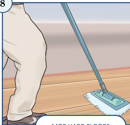
MOP HARD FLOORS

A lot of dust will settle on the floor from the surfaces you have cleaned. Use a Swiffer mop to clean any hard floors, such as hardwood or tile.