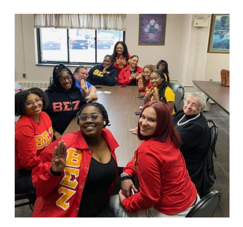
Students from SUNY Canton host a Game Day for residents of Canton Housing Authority!